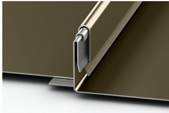
1.75" HIGH X 18" WIDE Q-175 PANEL

OPTIONAL FACTORY OR FIELD APPLIED SEALANT IN THE SEAM