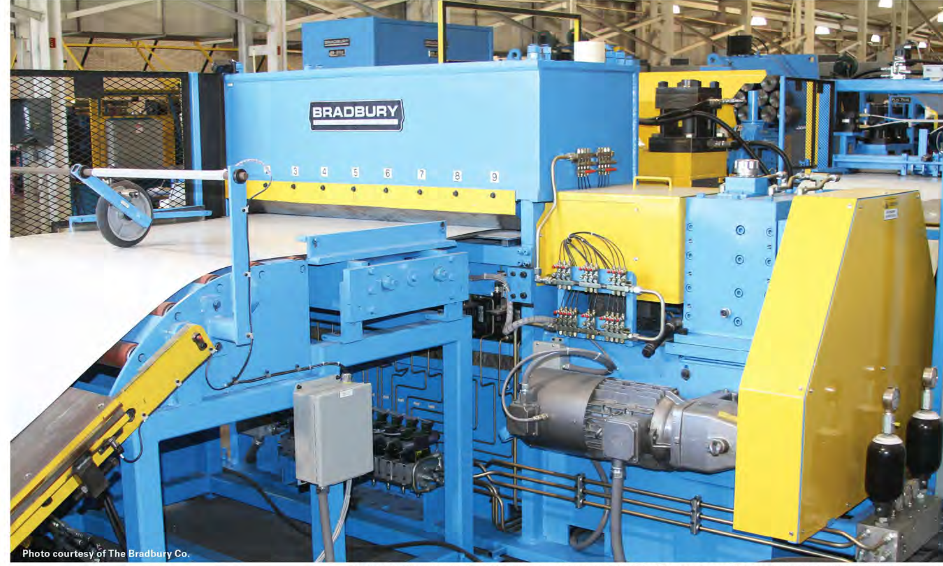
This is a Hydraulic Leveler, similar to a model that would be used to spec a standing seam or architectural panel line.

Fixed clips, which do not provide any movement for the panel, are used with snap lock panels so the panel can expand and contract independently of the clip. Fixed clips can also be used in shorter length mechanically seamed panels that are 20 feet or less because they should only expand and contract slightly, if at all. "Keep in mind that aluminum panels