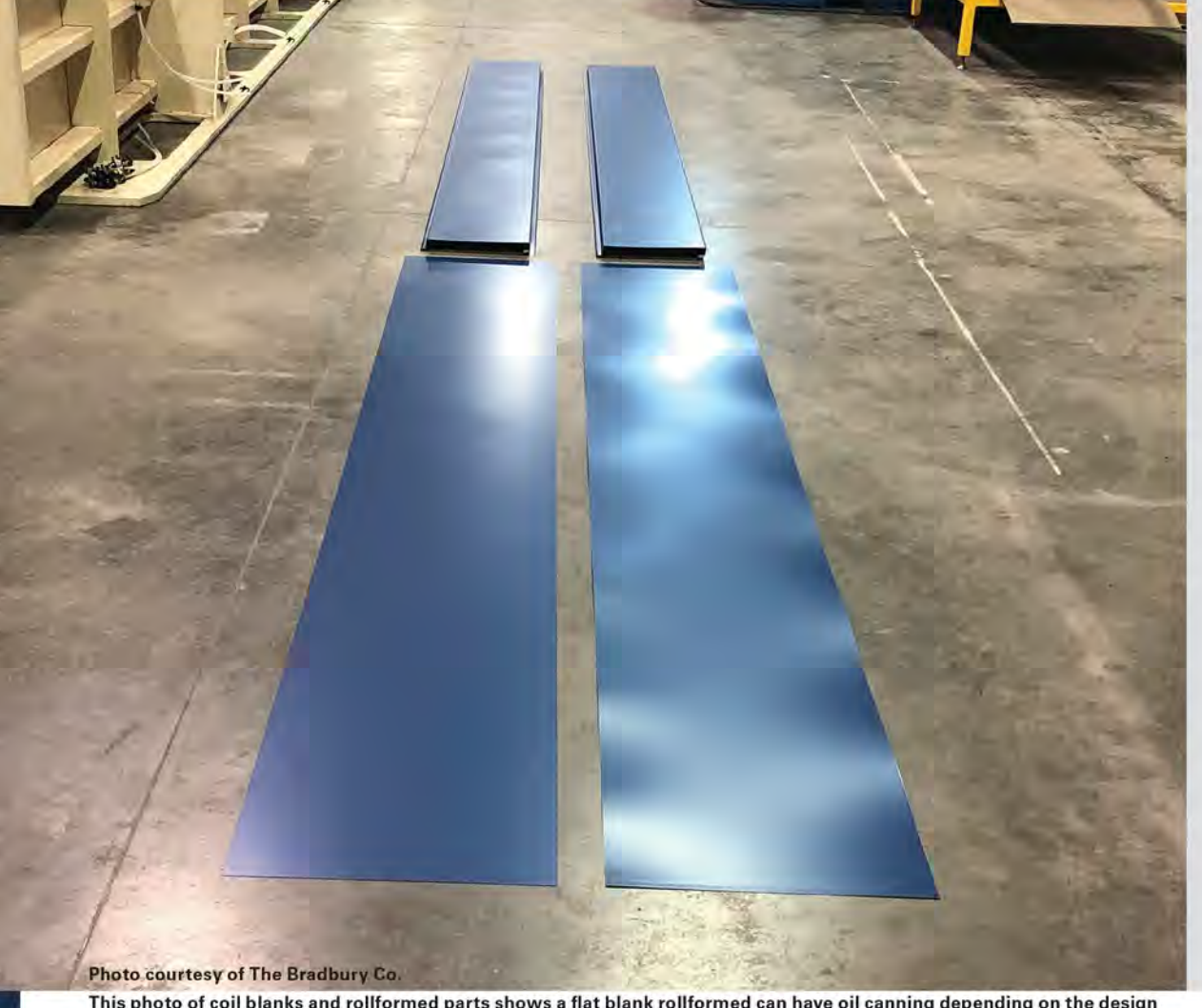
This photo of coil blanks and rollformed parts shows a flat blank rollformed can have oil canning depending on the design of the panel. If an edge is added to the coil with a leveler, oil canning can be reduced and sometimes eliminated.