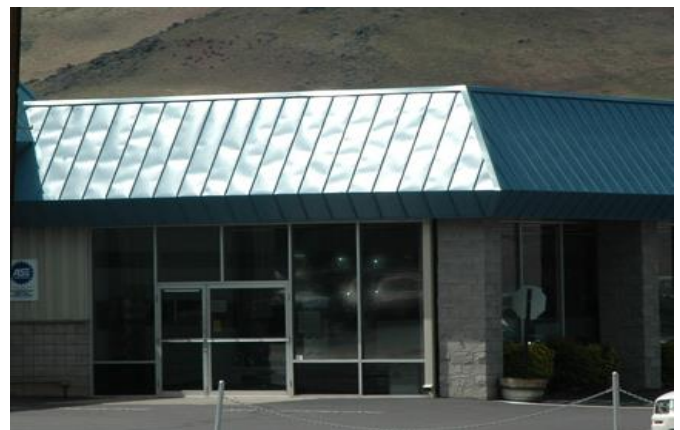
(Above and Right) These photos are minutes apart. The only difference is camera angle