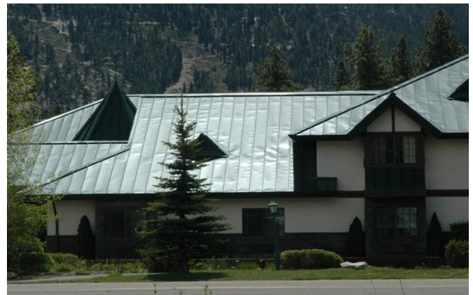
(Above and Right) The only difference is an hour in time and the changing the angle of the sun